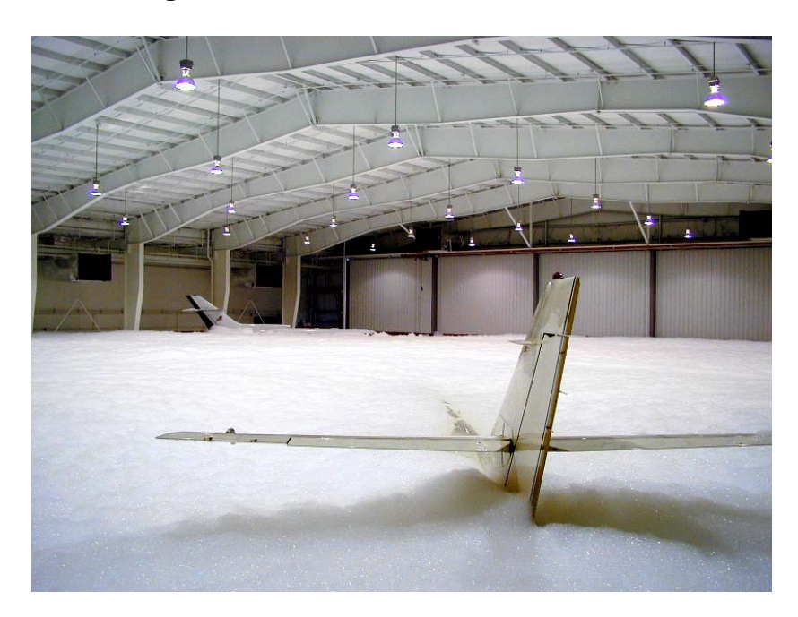
Figure A2.4. Low-Level High-Expansion Foam After 15-Minute Discharge