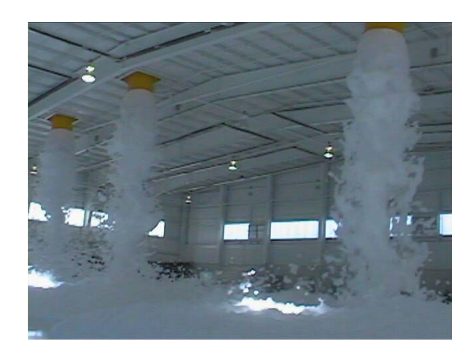
Figure A2.3. Low-Level High-Expansion Ceiling-Mounted Generators' Foam Discharge