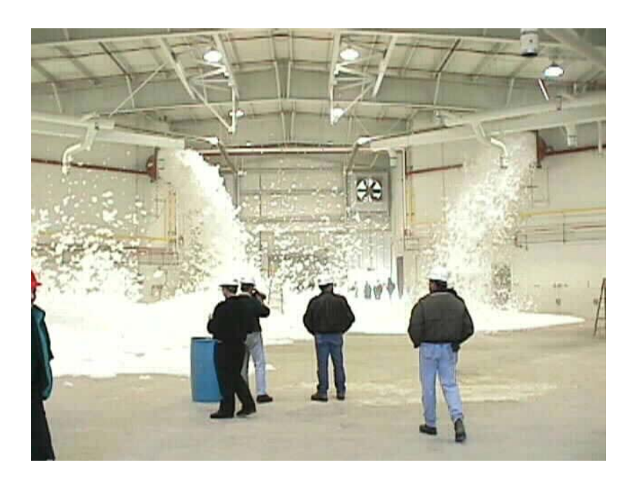
Figure A2.1. Low-Level High-Expansion Foam Wall-Mounted (Adjacent Leading Wing Edge) Generators' Initial Discharge