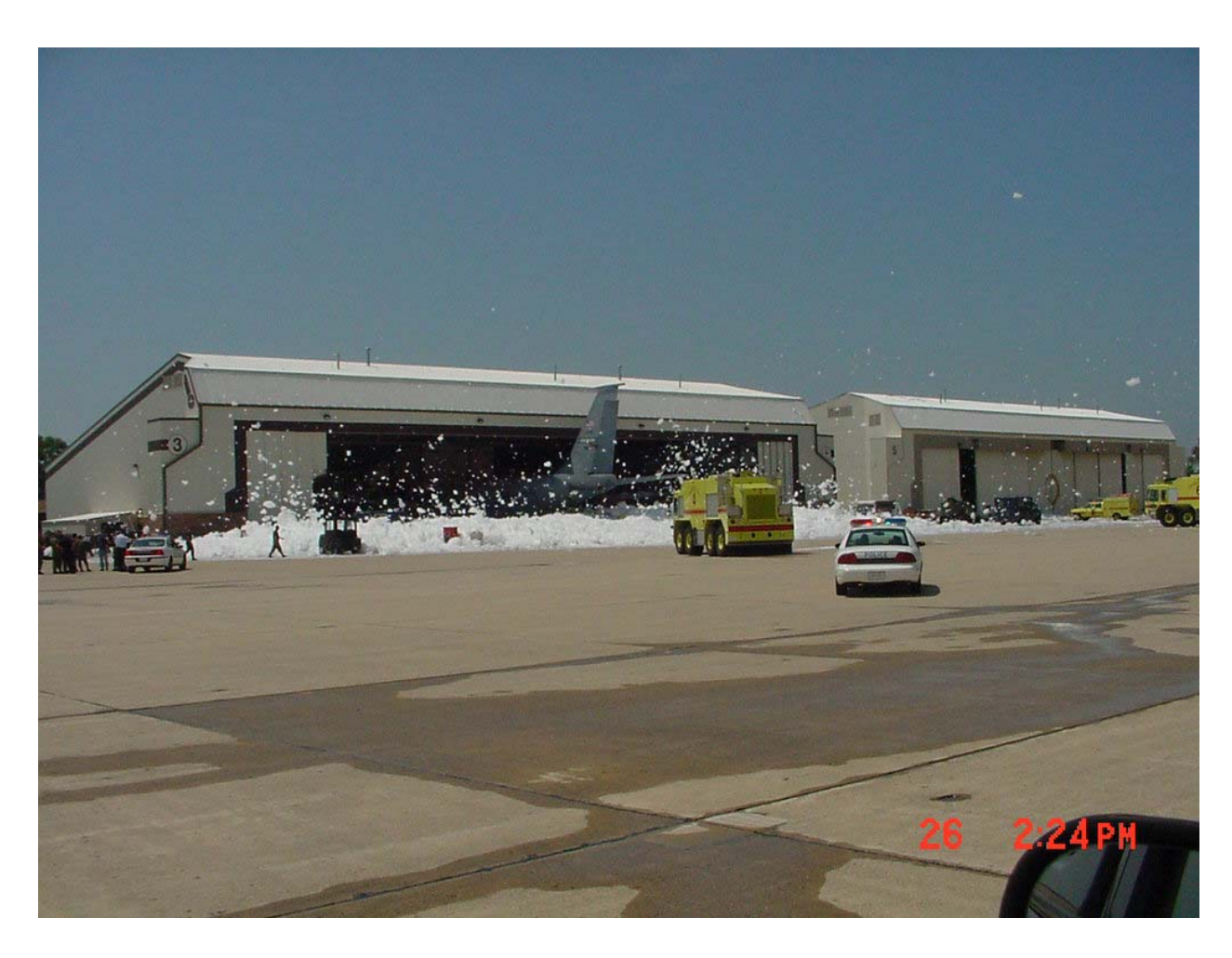
Figure A2.5. Low-Level High-Expansion Foam After 7-Minute Discharge