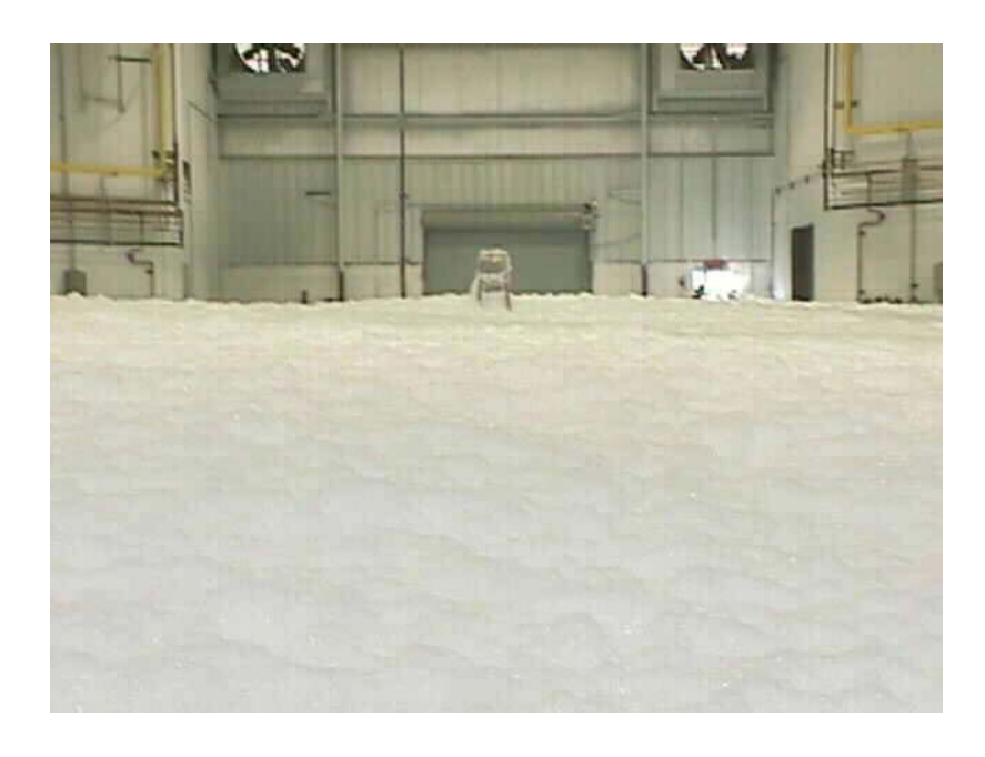
Figure A2.2. Low-Level High-Expansion Foam After Three-Minute Discharge